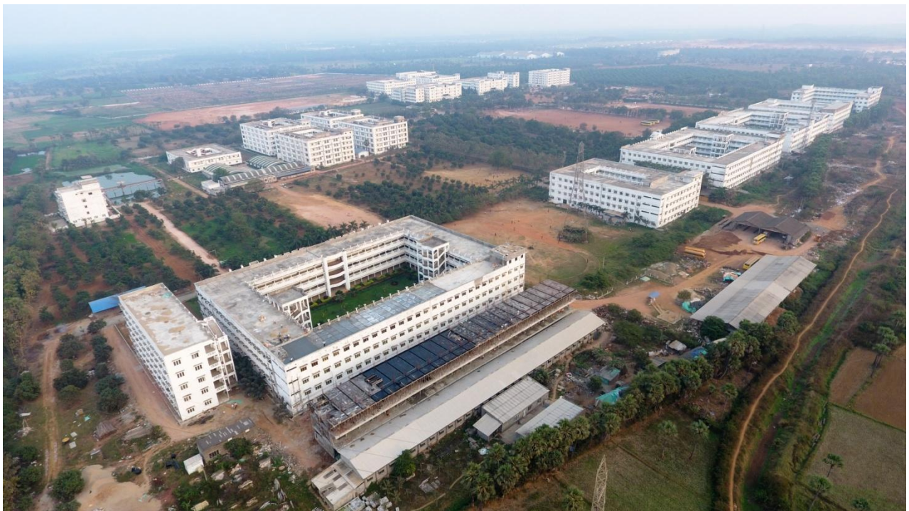
ADITYA COLLEGE OF ENGINEERING-BIRD'S EYE VIEW